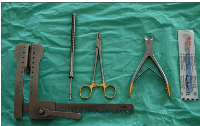
Fig. 3. Small resternotomy set packed with scalpel on top (above) and opened (below).